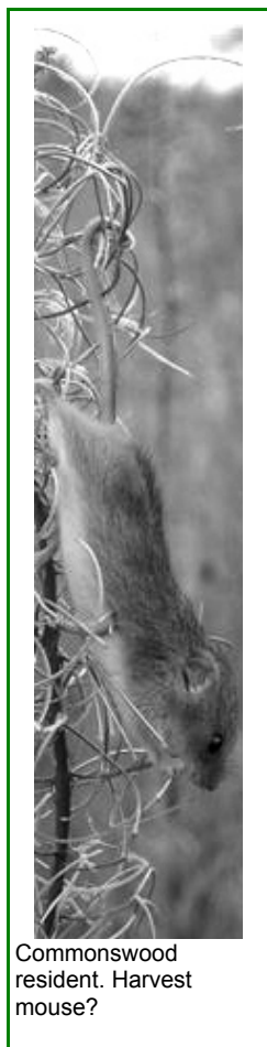
Commonswood resident. Harvest mouse?